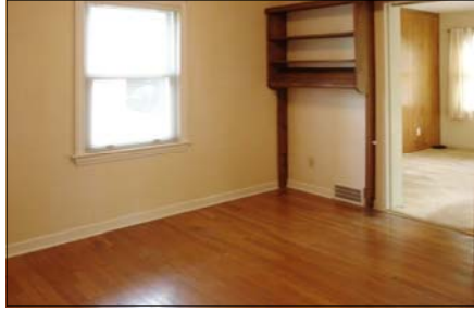
First floor bedroom or den/office with exposed hardwood floors.