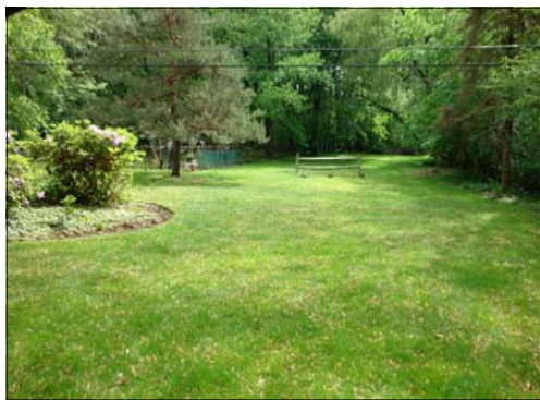
Simply wonderful park-like yard. Well landscaped. Large deck. Brick patio. Attached garage.