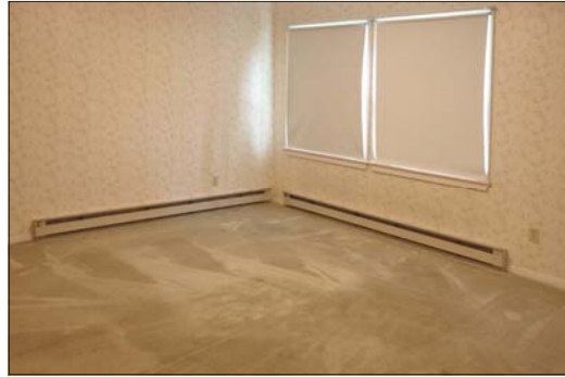
1st floor suite. 4/5 bedrooms. 3 baths.