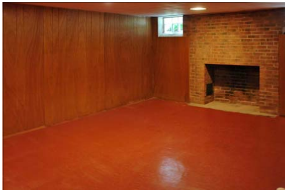
Central air. Newer roof & furnace. Updated electrical.